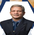
CA Dev Anand Dist. Governor